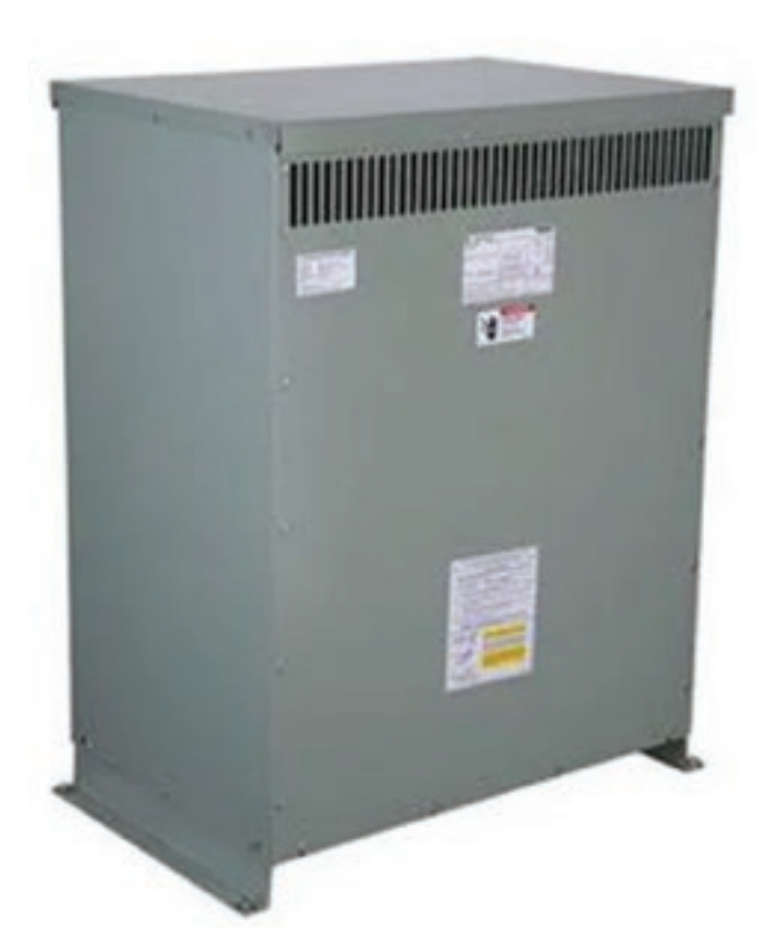
ABB GE Industrial 9T10A1002 General Purpose Transformer; 3 Phase, 480 Volt Primary, 208 Volt Y/120 Volt Secondary, 30 KVA #103976

ABB GE Industrial 9T10A1003 General Purpose Transformer; 3 Phase, 480 Volt Primary, 208 Volt Y/120 Volt Secondary, 45 KVA #106035