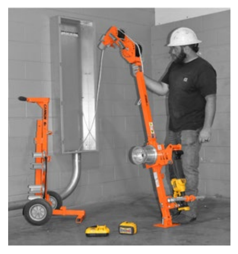
*Sold as Shown

Speed, versatility, and performance are all yours with iTOOLco's Cordless Cannon 6K<sup>TM</sup>. This portable 6,000 lb. puller is intuitively designed to handle all of your day-to-day wire pulls.