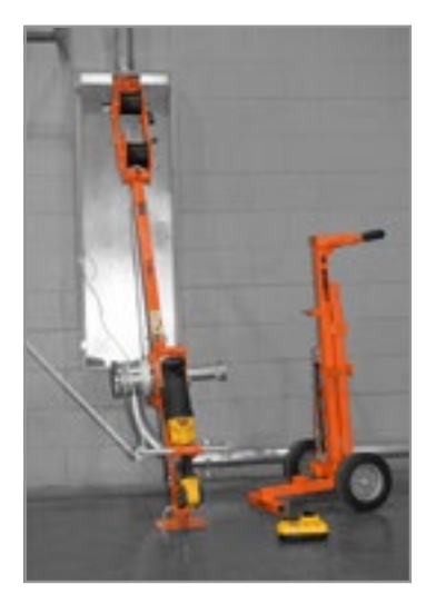
Handles Overhead, Underground, or Side Pulls with Ease.