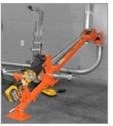
Fully Self Contained Unit FASTER SAFER WORKSPACE