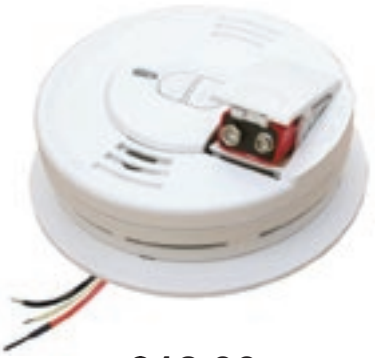
$12.99 ea. Kidde 21006376 AC Hardwired Smoke Alarm #43024