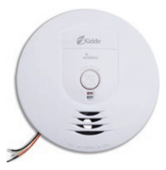
$59.99 ea. Kidde RF-SM-AC AC Hardwired Wireless Interconnect Smoke Alarm #66108

$42.99 ea. Kidde RF-SM-DC Battery Operated Wireless Interconnect Smoke Alarm #93637