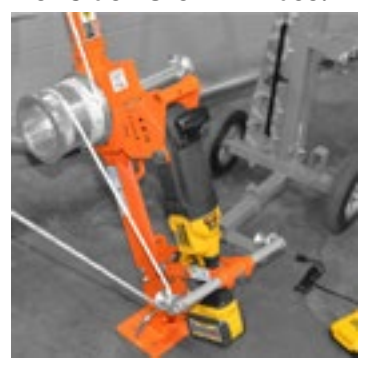
Built-in Rope Engagement Capstan Switch